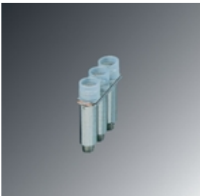
Fixed bridge, pitch: 5 mm, number of positions: 3, color: silver

Please be informed that the data shown in this PDF Document is generated from our Online Catalog. Please find the complete data in the user's documentation. Our General Terms of Use for Downloads are valid ( http://phoenixcontact.com/download )